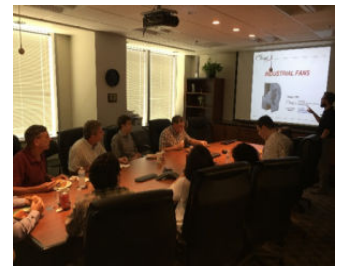
SysTech's Lunch and Learn "Fans 101: The Application of Fans in the Industrial Environment" reviewing important details of industrial fan applications.

The PDH presentation was titled "Industrial Fans for the Water and Wastewater Industry" and the Lunch and Learn topic of "Fans 101: The Application of Fans in the Industrial Environment" are just a sampling of the many educational topics SysTech has to offer.