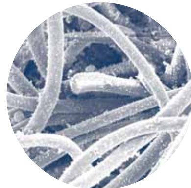
Polyester Bag–Clean Air Side (300x)